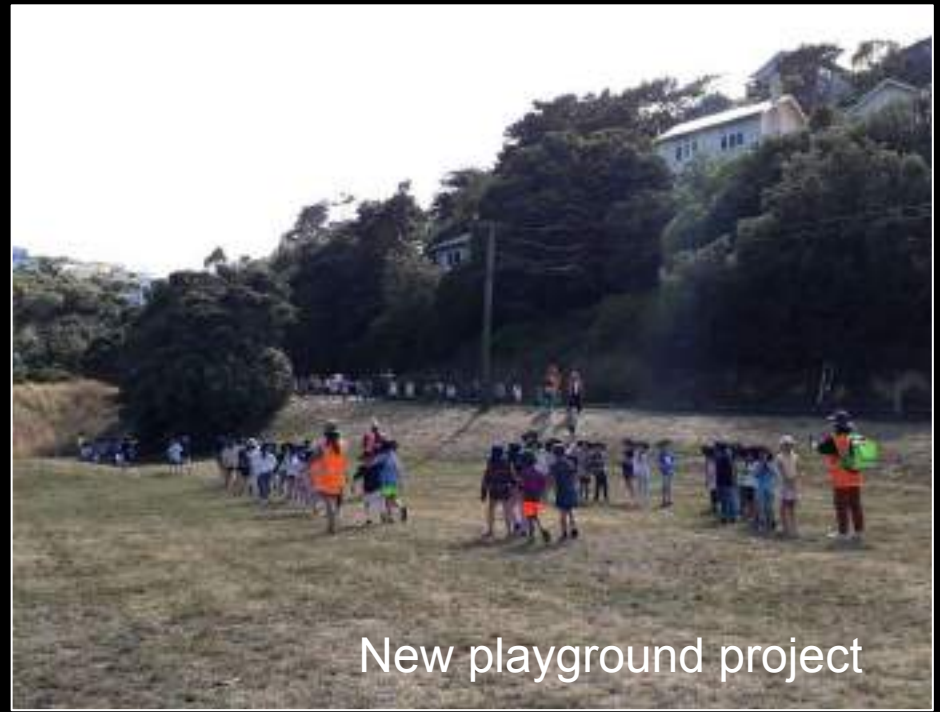
New playground project

Our school embracing the past and the future