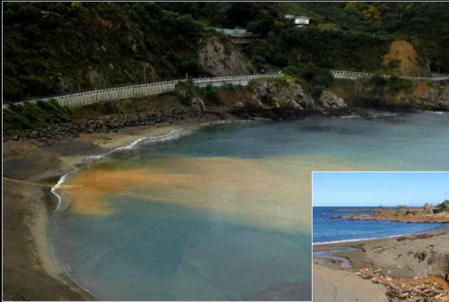
Leachate in Taputeranga marine reserve