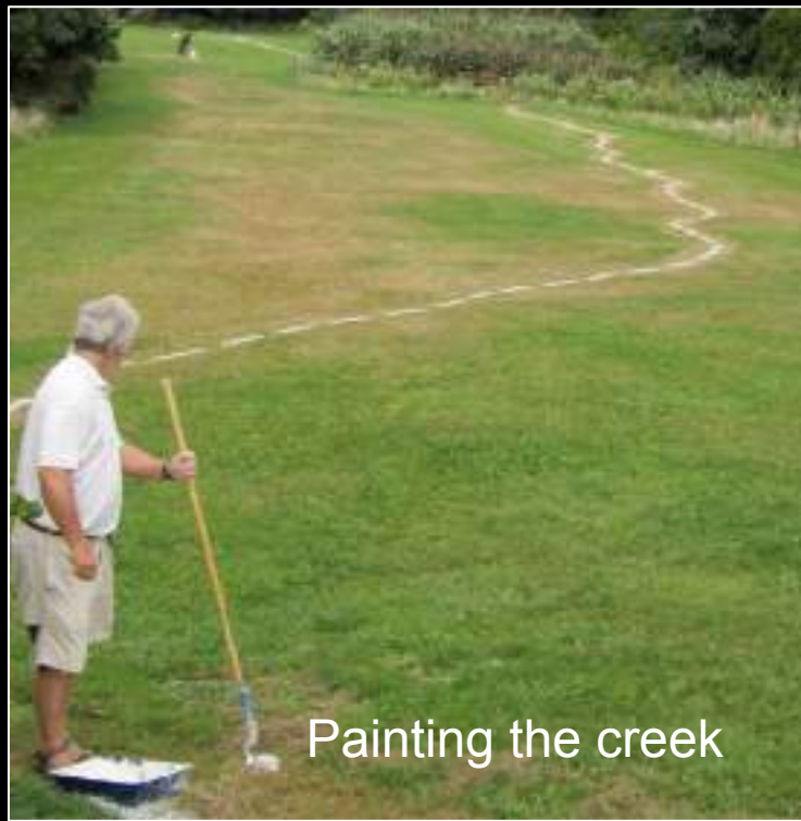
Painting the creek