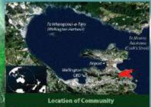
Location of Community

A project to build community by locals from Hoo-wai / Houghton Valley, Te Whanganui-a-Tara / Wellington, Aotearoa / New Zealand